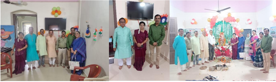
Sampatrai RCC SCH