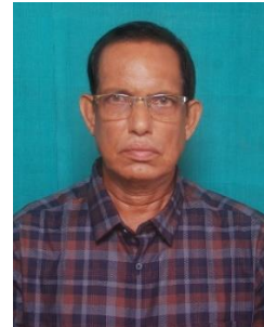
Sri Baikuntha Nath Mishra C. S. Dev Ucha Vidyalaya, Jayapur, Khurda